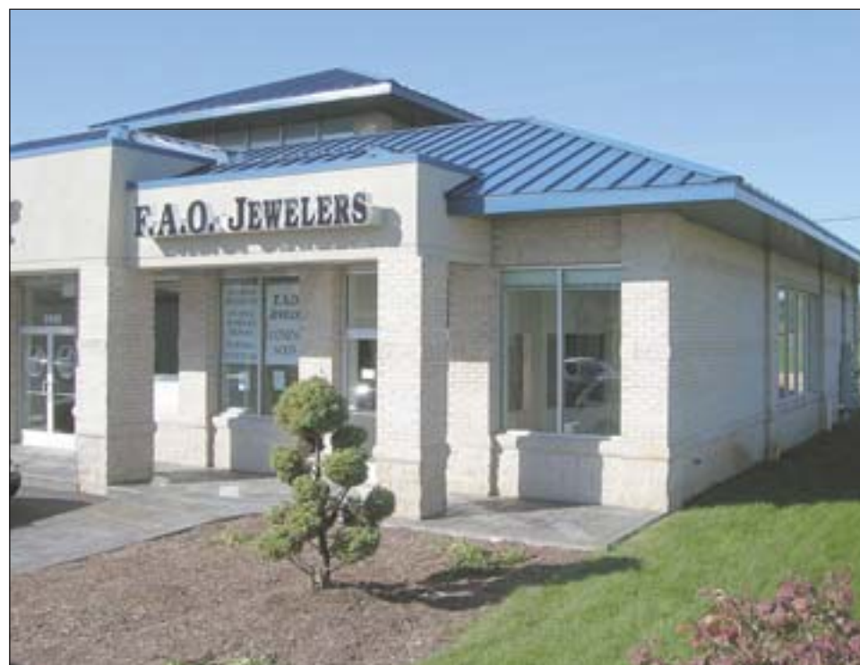
F.A.O. Jewelers' new store in Hartland is located at the corner of Old U.S.-23 and M-59 in the Fountain Square Plaza